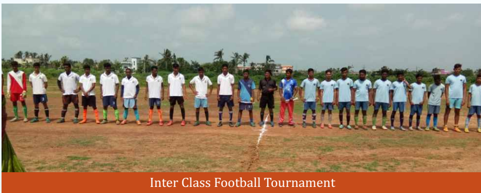
Inter Class Football Tournament