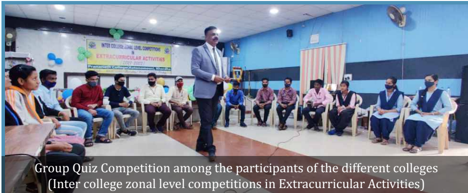
Group Quiz Competition among the participants of the different colleges (Inter college zonal level competitions in Extracurricular Activities)