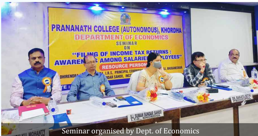
Seminar organised by Dept. of Economics