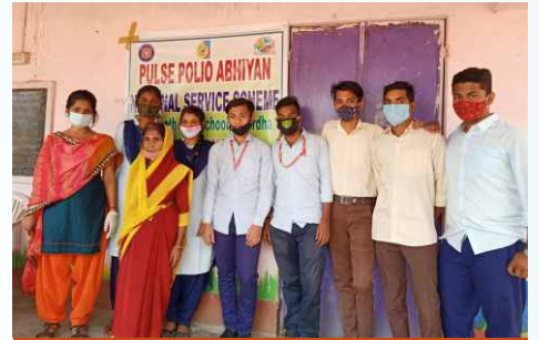
Pulse Polio Abhiyan organised by NSS wing of the college