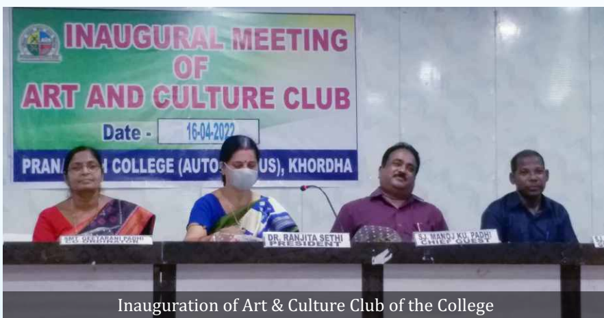
Inauguration of Art & Culture Club of the College