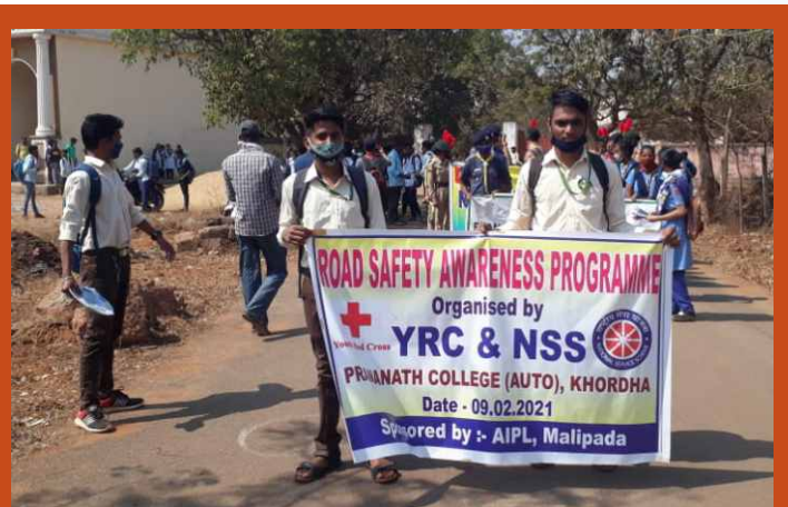
Road Safety Awareness Programmee organised by YRC & NSS wings of the college