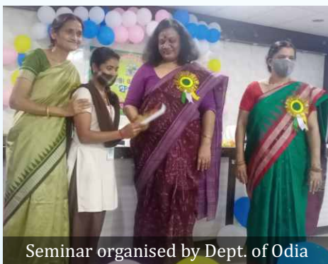
Seminar organised by Dept. of Odia