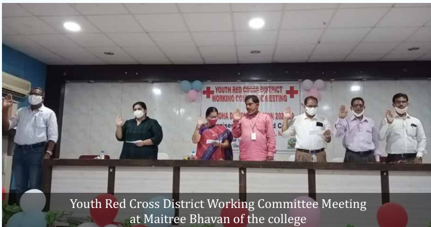
Youth Red Cross District Working Committee Meeting at Maitree Bhavan of the college