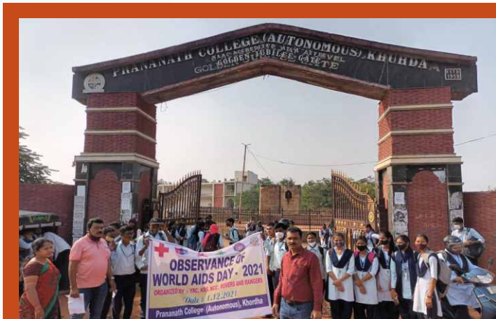
World AIDS Day 2021 observed by YRC, NSS, NCC, Rovers & Rangers wings of the college