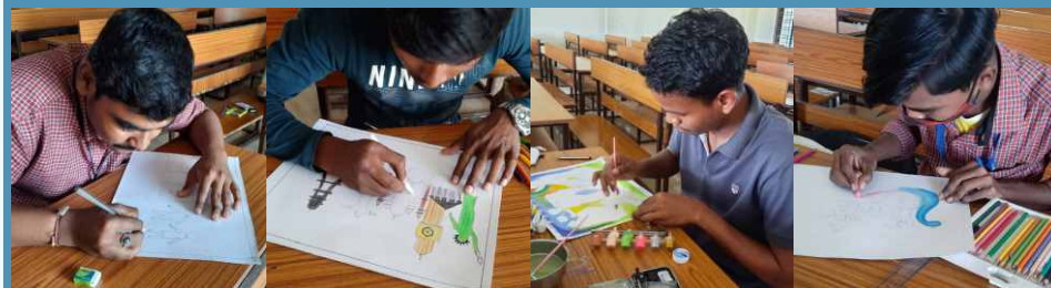
Inter College Zonal Level Painting Competition