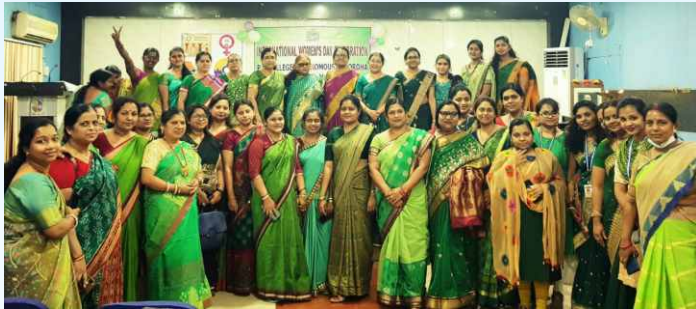
International Women's Day 2022 observed