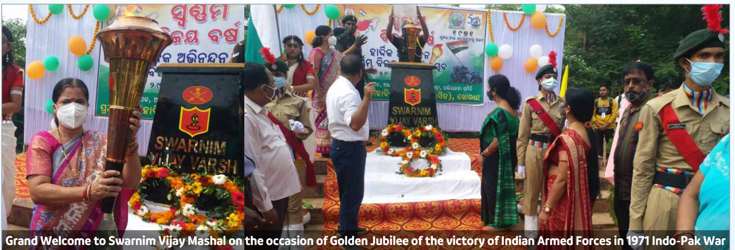
Grand Welcome to Swarnim Vijay Mashal on the occasion of Golden Jubilee of the victory of Indian Armed Forces in 1971 Indo-Pak War