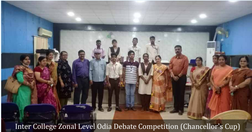
Inter College Zonal Level Odia Debate Competition (Chancellor's Cup)