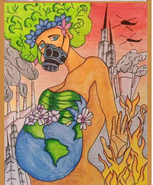
Paintings by the students on the occasion of International Earth Day 2022