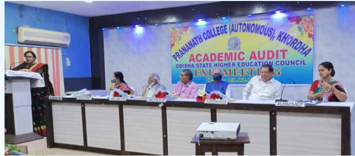
Academic Audit of the College by Odisha State Higher Education Council