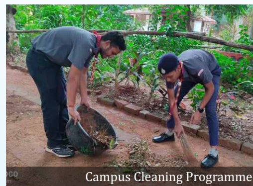
Campus Cleaning Programmee by the Rovers & Rangers