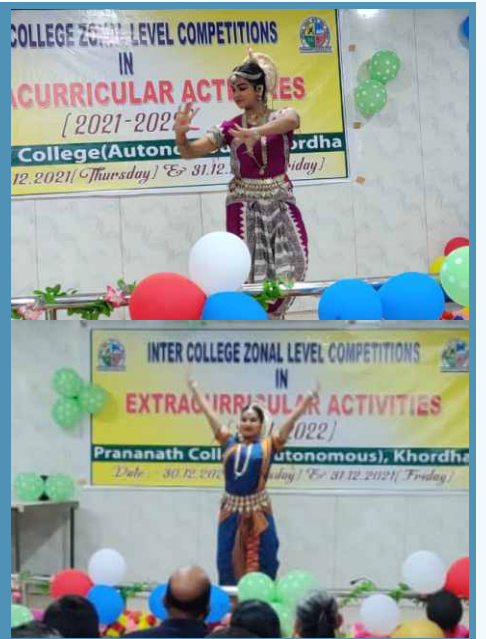
Inter College Zonal Level Classical Dance Competition