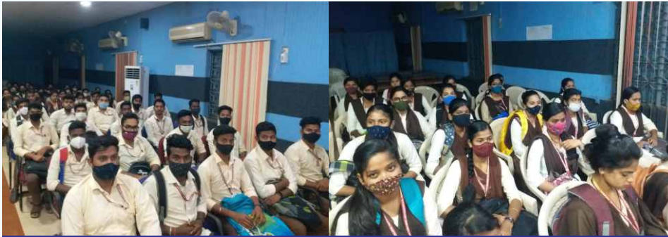
Students attending YUVA SANSKAR Classes