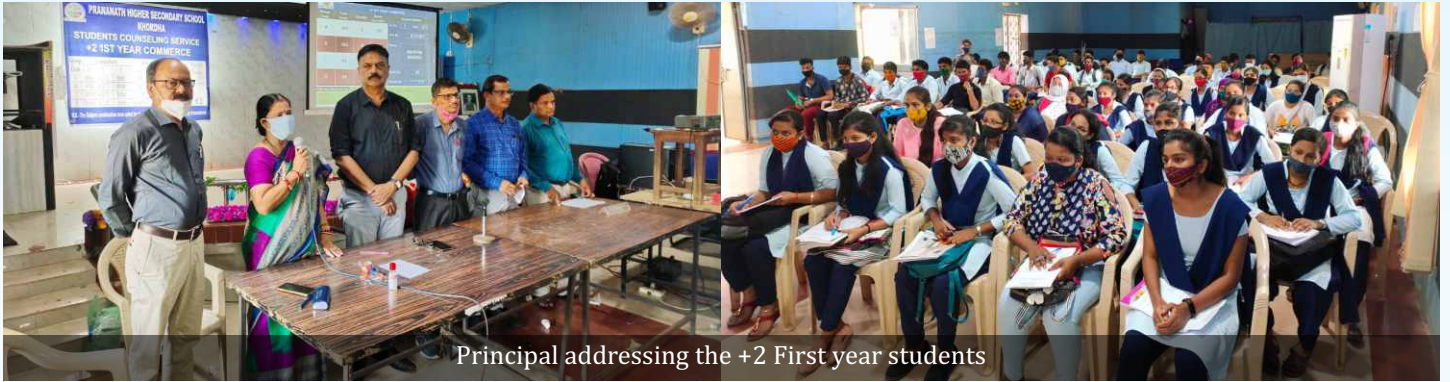
Principal addressing the +2 First year students